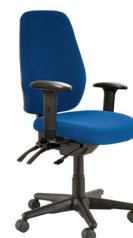
Featured in Dark Blue, with arms