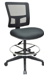
Metro II Connect - Architectural