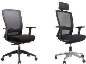
NYLON BASE Arms

Adjusts the seat depth to accommodate taller users and/or longer leg lengths.