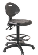
ARCHITECTURAL GAS LIFT with Black P/C Foot Ring

195-PU3 Enso 195-PU-AT Enso Architectural