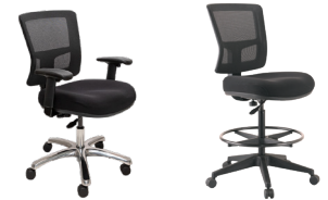
ALI BASE With Arms

212-153-ARCH Metro II Connect Architectural