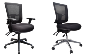
NYLON BASE With Arms

222-N-153 Nylon Base 222-153 Aluminium Base