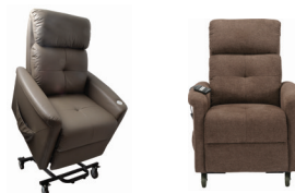
POWER LIFT standing position POWER LIFT with rear castors only