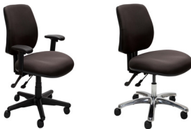
NYLON BASE With Arms