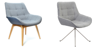
4 LEG WOOD BASE Custom upholstery with buttons 4 STAR SWIVEL BASE Custom