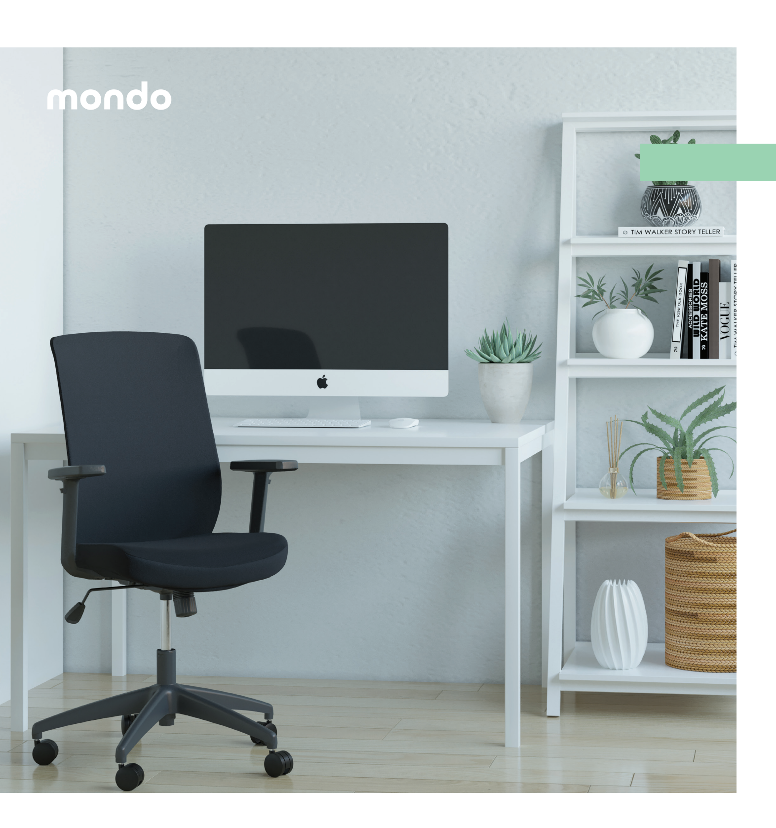
Mondo Gene. Upholstered Back.