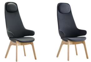
HIGH BACK Black PU