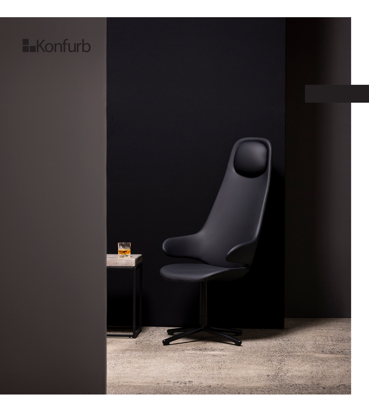
Konfurb Orbit. Swivel Pedestal.